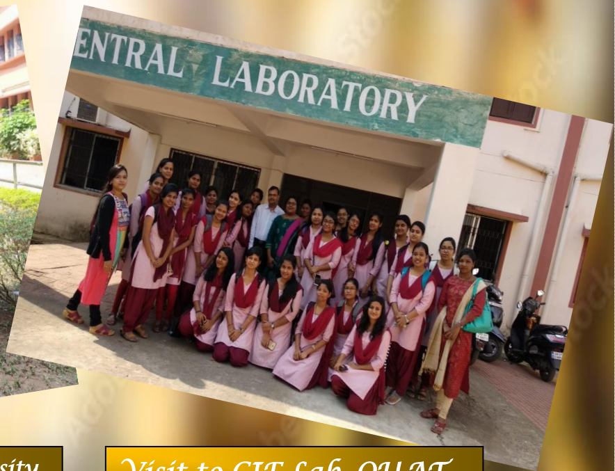
Visit to CIF Lab, OUAU