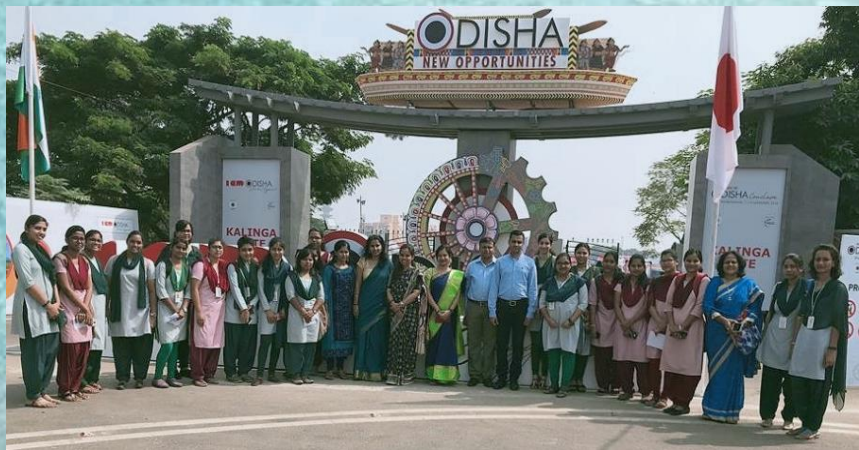
Visit to Odisha Conclave