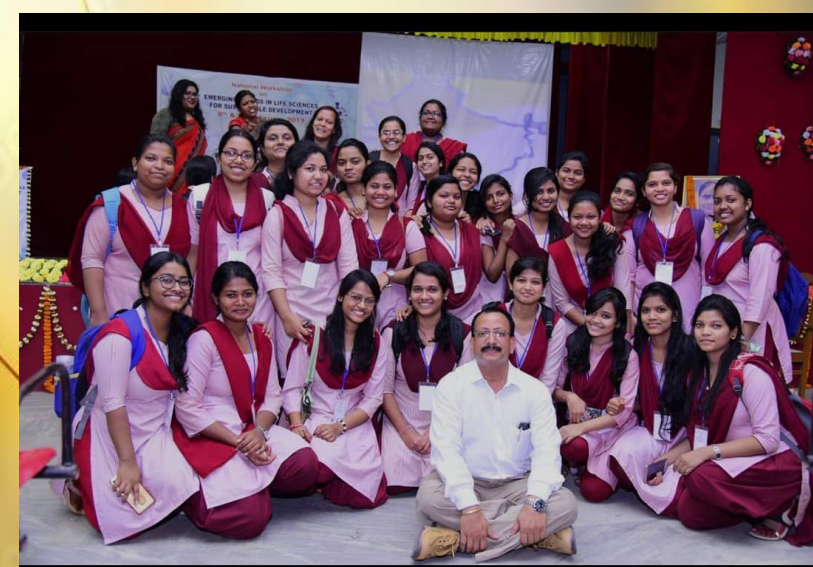
National workshop at RDWU