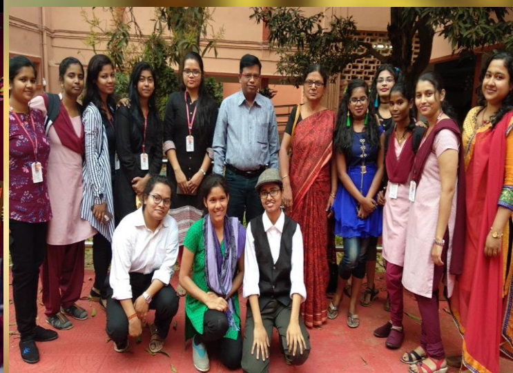
Science Society Function