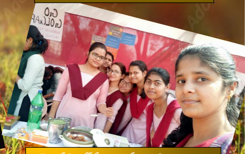
Food Stall by students in campus celebration