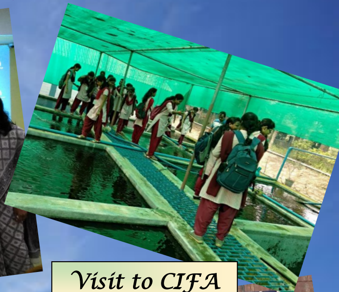
Visit to CIFA