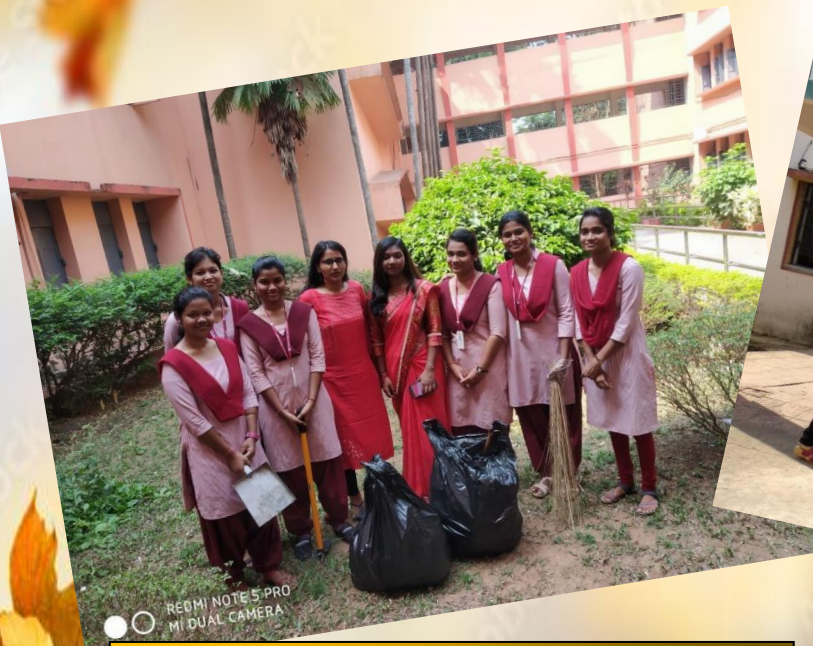
Swachh Bharat Abhiyan at University