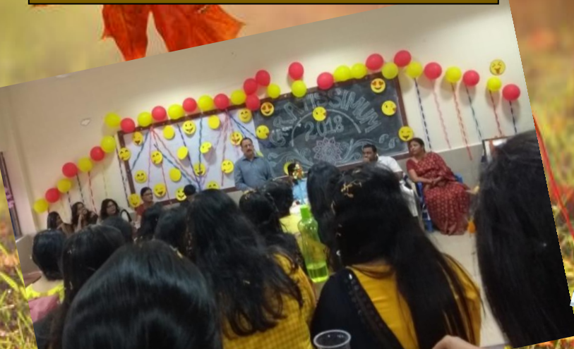
Welcome ceremony 2018